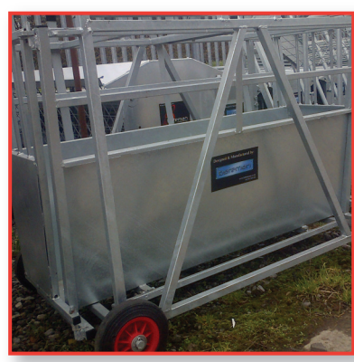
Lamb weigh £400