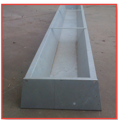
9' Galvanised sheep troughs £23

Buy 10 Dalesman Tri-mag buckets and get another one free.