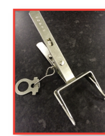
Claw mole traps buy 4 get a 5th FREE