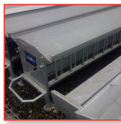
8' Lamb creep feeder £240 8' Lamb creep shelter £350