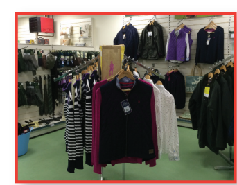
Jack Murphy clothing now available in store