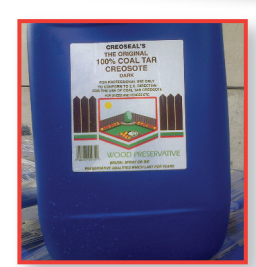
Traditional coal tar creosote 25ltrs £36